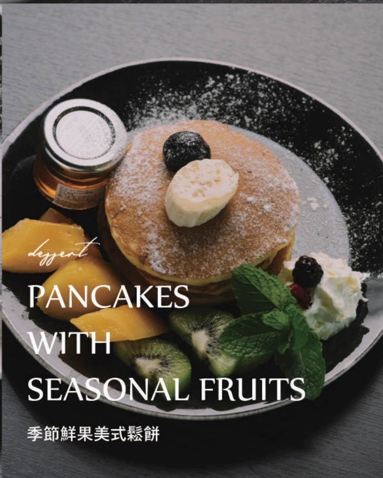
dezzent PANCAKES WITH SEASONAL FRUITS 季節鮮果美式鬆餅